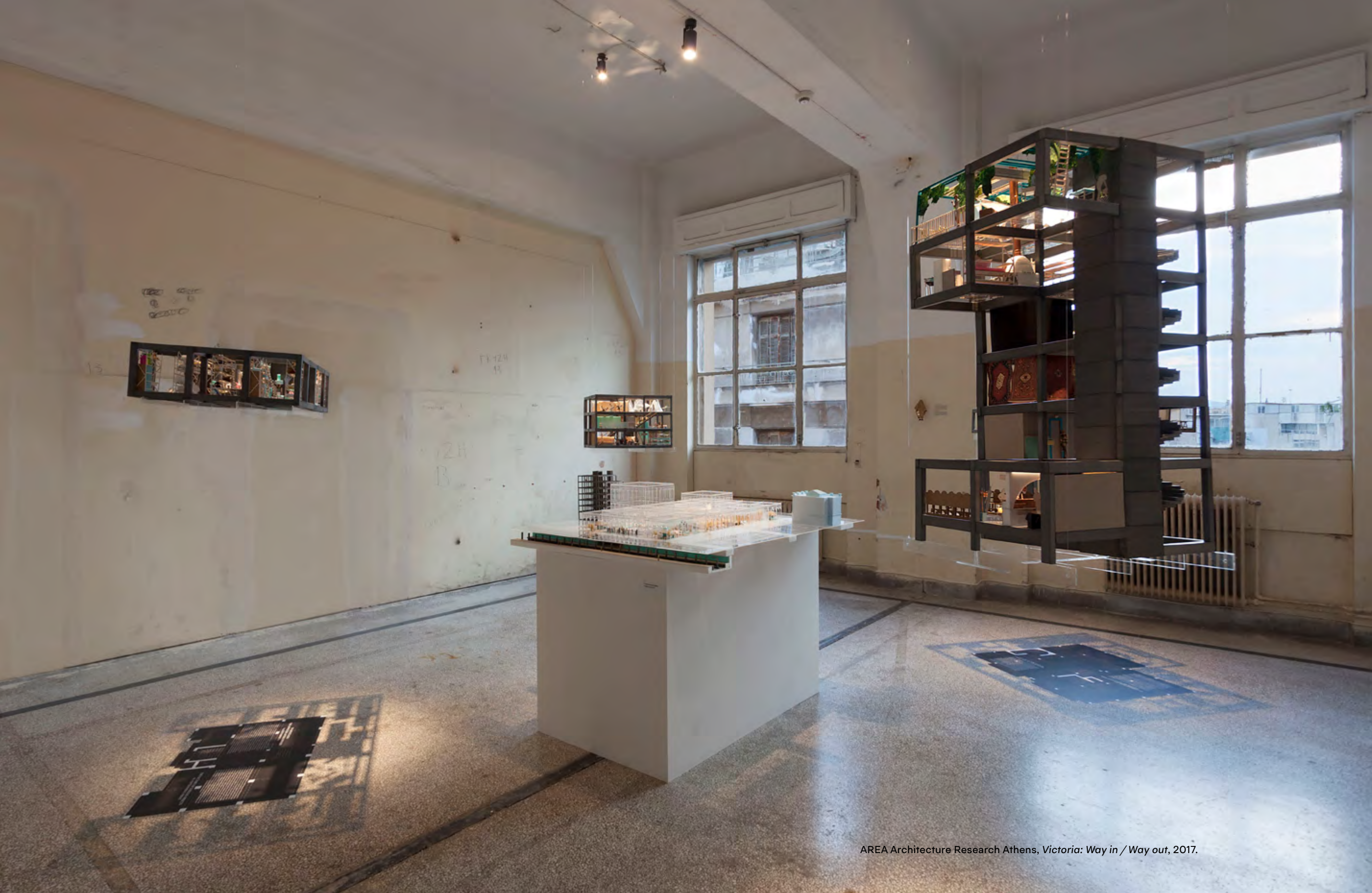
AREA Architecture Research Athens, Victoria: Way in /Way out, 2017.